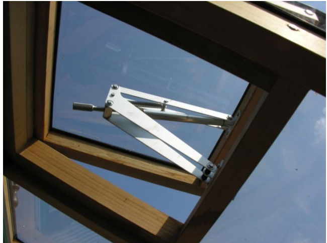
Above picture shows a triple spring autovent

Autovents operate on a wax cylinder system, so requires no electricity.