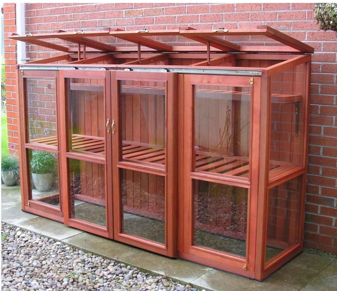
An 8ft x 2ft coldframe (in red cedar preservative)

Our tall coldframes are made from high quality Western Red Cedar with sliding front doors and opening tops, fitted with 4mm toughened safety glass.