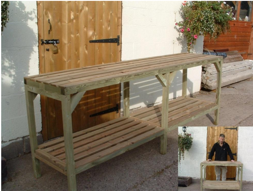
94" model with complete removable lower shelves

Over the years we have been asked to design and manufacture strong functional greenhouse staging and are extremely proud of our Goliath staging because we believe it is probably the strongest available on the market.